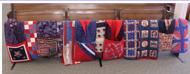
A portion of the quilts presented at both services went to the Women's Trauma and Recovery Center at the Seattle VA hospital.